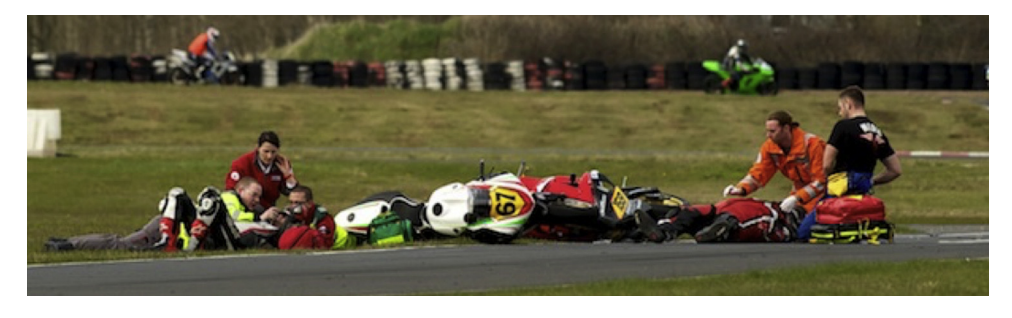
Fig. 3. Motorcyclist lying apnoeic following a collision (with permission).

M.H. Wilson et al. / Resuscitation xxx (2016) xxx-xxx